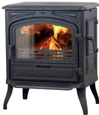
Limousin Black side loading door