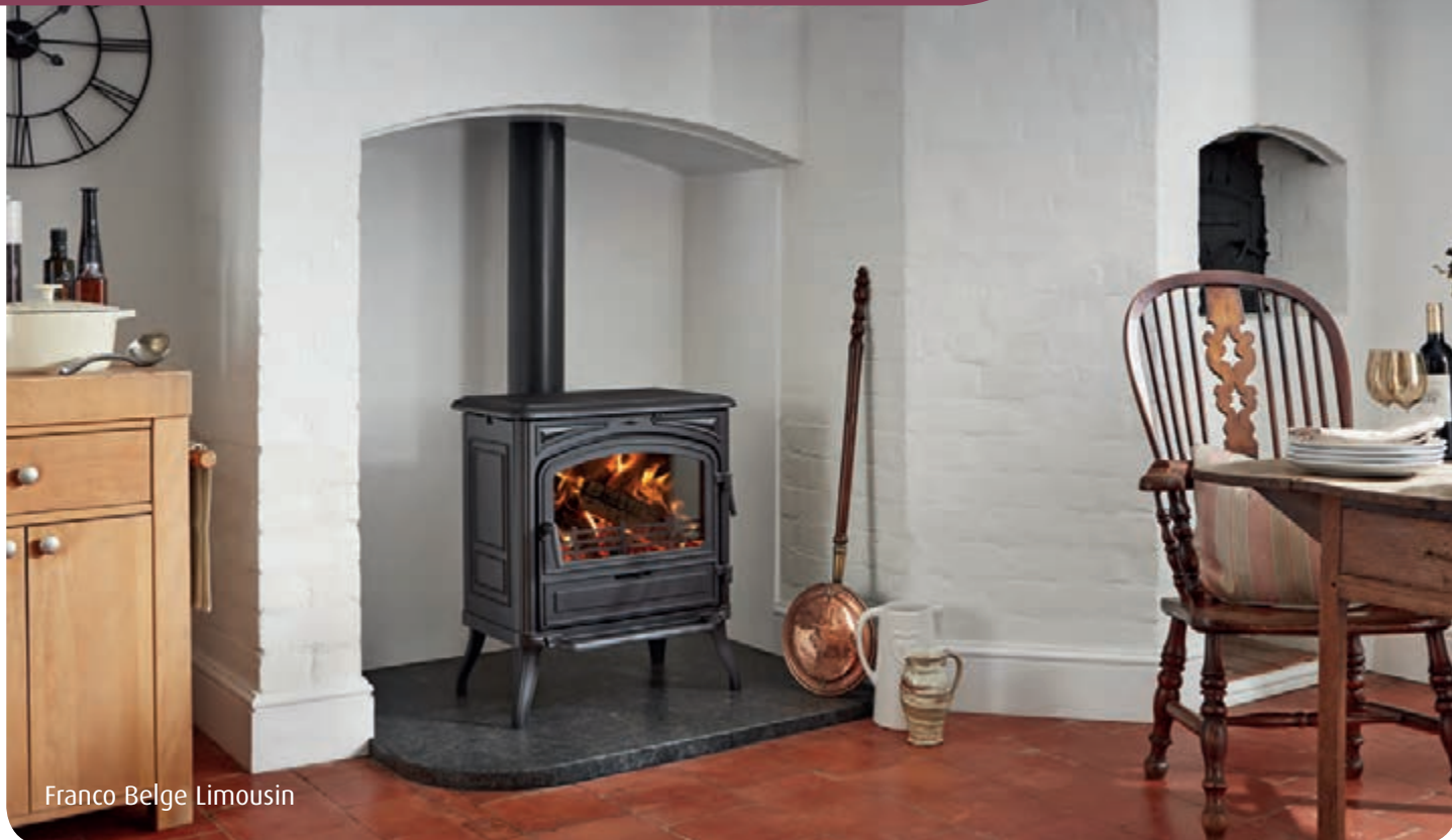
Franco Belge Limousin