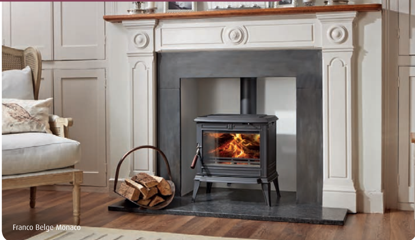
Franco Belge Monaco