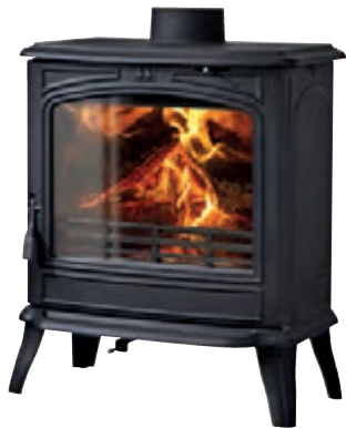
Savoy Elegance Black