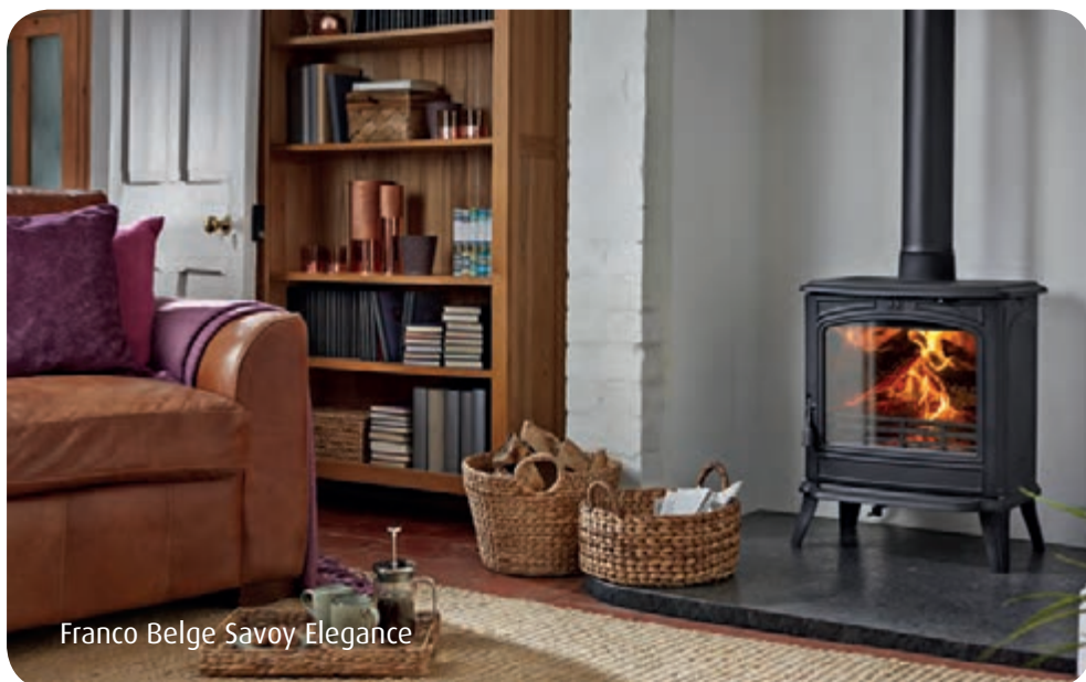
Franco Belge Savoy Elegance

A smoke exempt kit must be installed on the Savoy Elegance stove when being used to burn wood in a designated UK smoke control area.