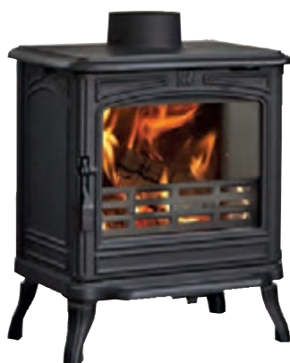
Montfort Elegance Black