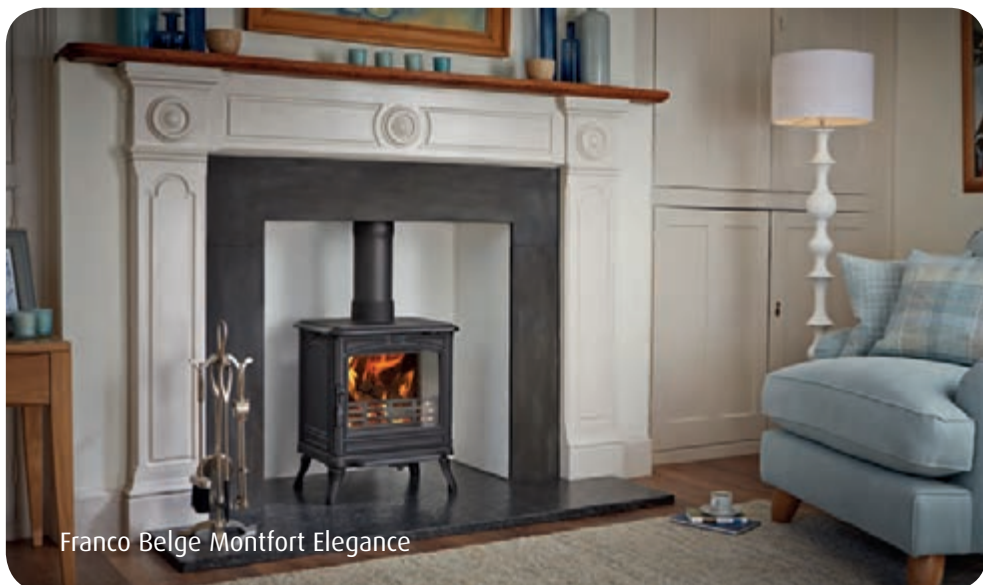
Franco Belge Montfort Elegance